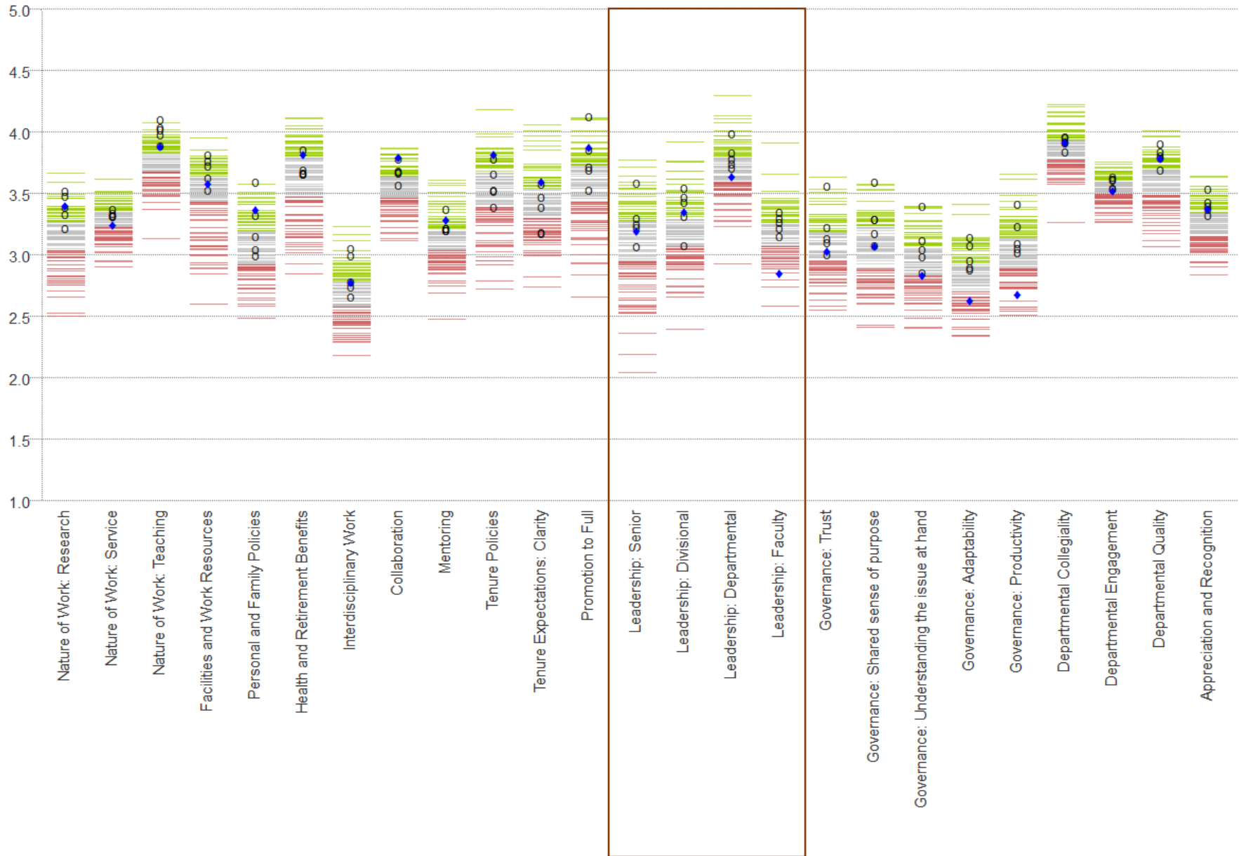
Figure 2: Summary of Comparative Analysis - All Faculty